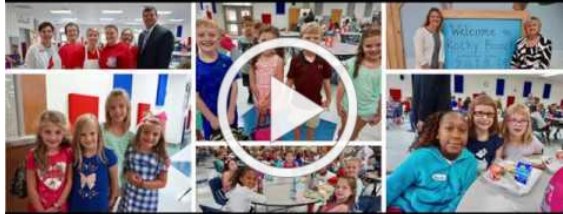
Rocky Branch Elementary First Day of School

Please check out the short video below for highlights from graduation until the first week of school! It has been a great start to the 2018-19 school year, and highlights will be shared throughout school year.